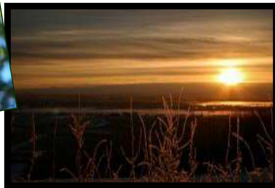
Winter Solstice Dec 21 2004, Alaska

Please check the MVUUF website for updates to December services.