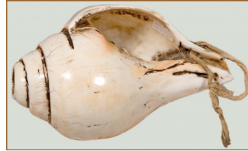
Conch Shell Trumpet ( Dung Dkar ), Tibet, 20th Century http://orgs.usd.edu/nmm/ Tibet/7204/ ConchShel7204.html